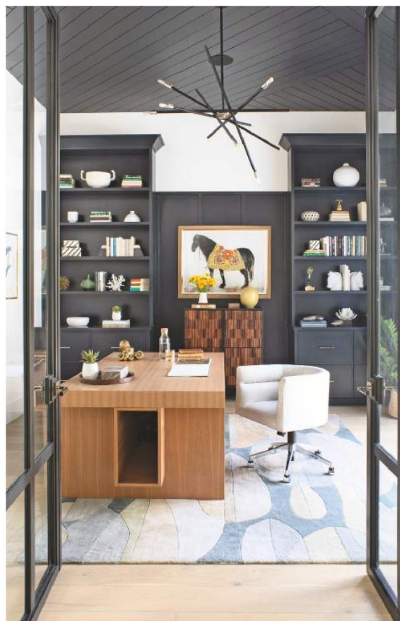
WORKFROMHOME The custom desk was designed to hide hard drives and cables for all monitors and tech equipment. The light-toned wood stands in sharp relief against the navy cabinetry.

utilized as a base to ground the aforementioned much brighter shades.