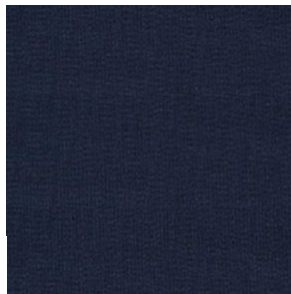
Sea Gull Bay