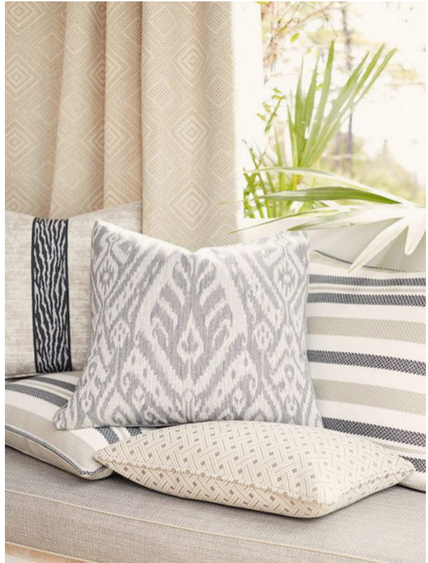
ISOLA INDOOR/OUTDOOR COLLECTION SCALAMANDRE

For me, the inspiration of the natural world is the major source of my work and 'seeing blue' in the world is one of life's pleasures plus, great fodder for the creative eye. So, next time you think about blue, think of bringing it inside your home. It is really one of the best colors in nature's magnificent palette.