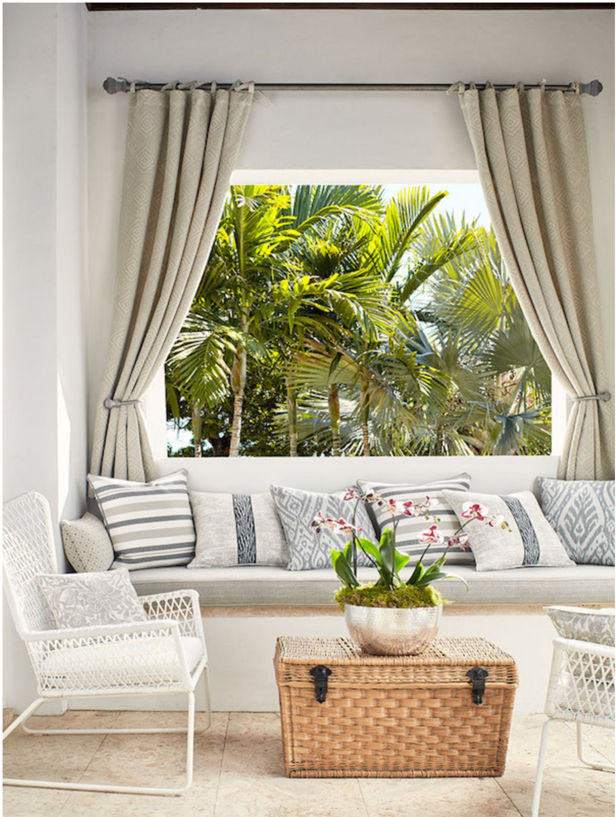
ISOLA INDOOR/OUTDOOR COLLECTION SCALAMANDRE