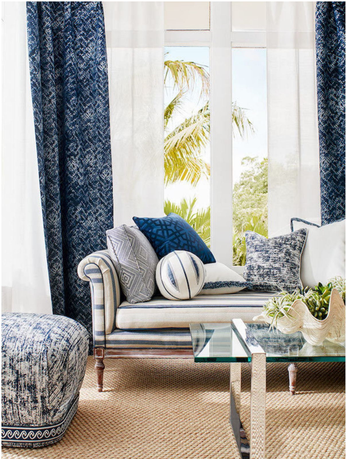
ISOLA INDOOR/OUTDOOR COLLECTION SCALAMANDRÉ