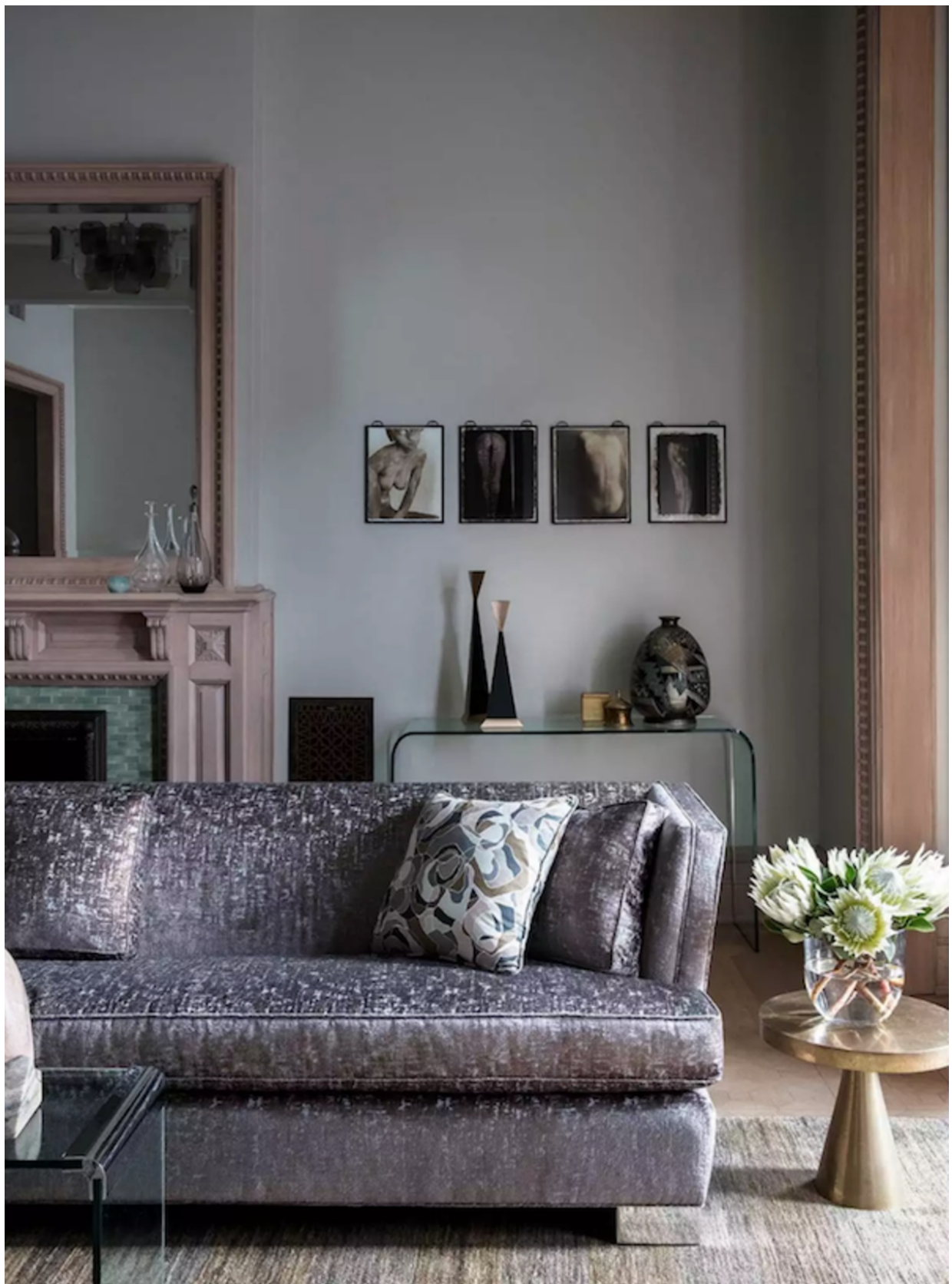
ROBERT ALLEN DESIGNSTUDIO