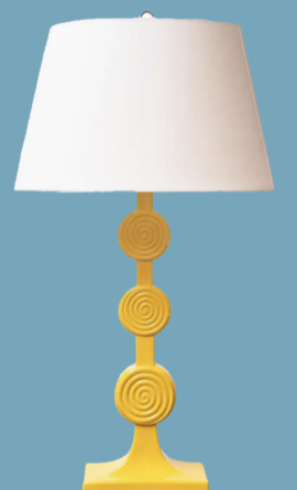
Mid-Century Yellow Ceramic Lamp

The 9' canopy features a block stripe in Watermelon and Sage Green, with a Scalloped Valance, finished with Sea Spray braid trim. Solid aluminum hubs, finial, and fittings are used, for the ultimate balance in strength and refinement.