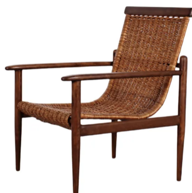
Brown Rattan Armchair, 1960s