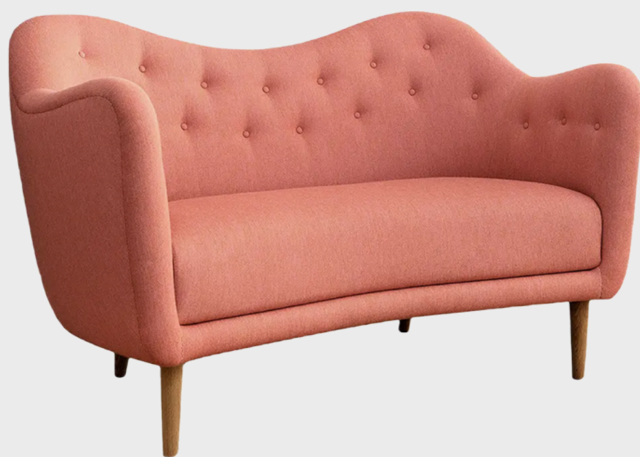
Wood and Fabric 46 Sofa Couch by Finn Juhl for Design M

Sofa designed by Finn Juhl in 1946, relaunched in 2008, and manufactured by House of Finn Juhl in Denmark. Juhl had a dream of becoming an art historian. During the 1930s & 1940s, strongly influenced by modern art, his designs took on such organic shapes with almost human-like features.