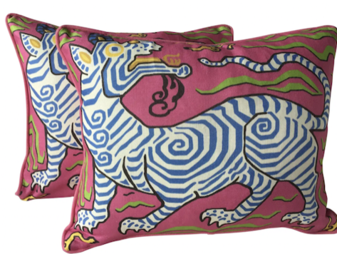
Clarence House Tibet Dragon Hot Pink and Blue Down Filled Pillow - a Pair

Pair of sconces in the style of mid-century modern with 8" glass balls.