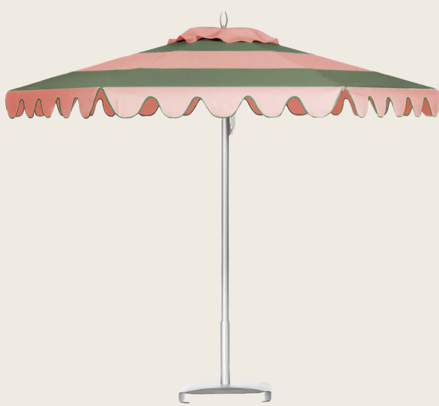
Ball Sunrise Patio Umbrella

Rasia is derived from the Latin word for "easy-going." This Mid-century Modern lounge chair will give you casual vibes. The Rasia Lounge Chair is a must-have for a home office, living room, or bedroom with linen upholstery, wood shell back, and metal base.