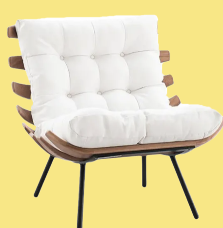
Vesta Rasia Lounge Chair

I want to share some of the great pieces I found at Chairish . A marketplace where you can go shopping for great things.